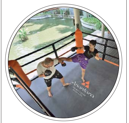
From top: one of the 10 Premier Rooms; each boxing student is kitted out with hand wraps and genuine Muay Thai gloves.

Anantara Layan Phuket offers nine types of accommodation options.